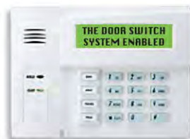
Example of Basic Monitoring Keypad Console

The Door Switch is a patented design. (Patent No. 7,466,237)