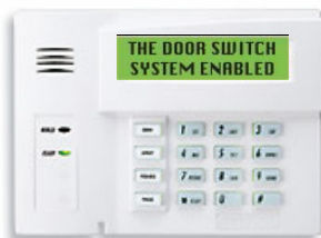
Example of Basic Monitoring Keypad Console

All system components are electronically supervised and will notify if maintenance is required. Monitored doors can be isolated from the system during maintenance.