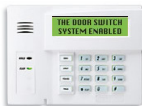
Example of Basic Monitoring Keypad Console

All system components are electronically supervised and will notify if maintenance is required. Monitored doors can be isolated from the system during maintenance.